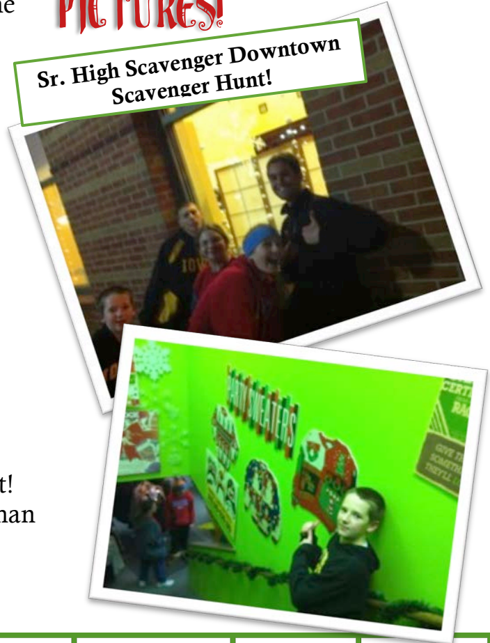
Sr. High Scavenger Downtown Scavenger Hunt!